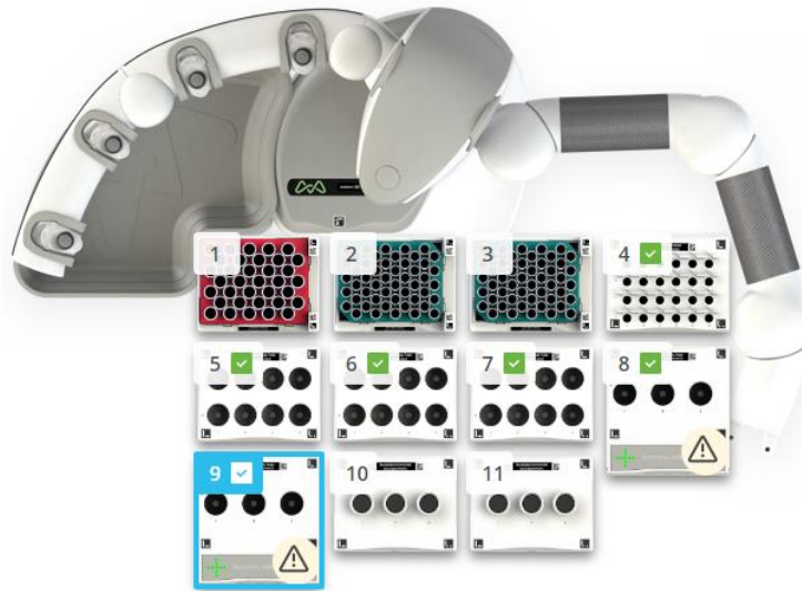
Figure 2: Exemplary deck layout (narrow)

Note: Please make sure to double-check the exact positions of dominos as indicated in the OneLab software prior to start.